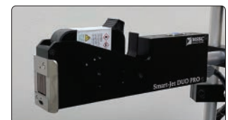
Smart-Jet® DUO PRO Printhead