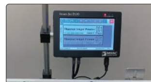
Smart-Jet® DUO Controller