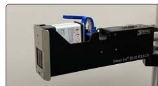
Smart-Jet® DUO REACH