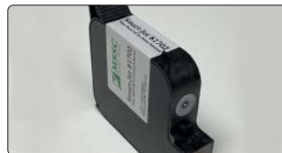
TIJ 1" cartridge technology