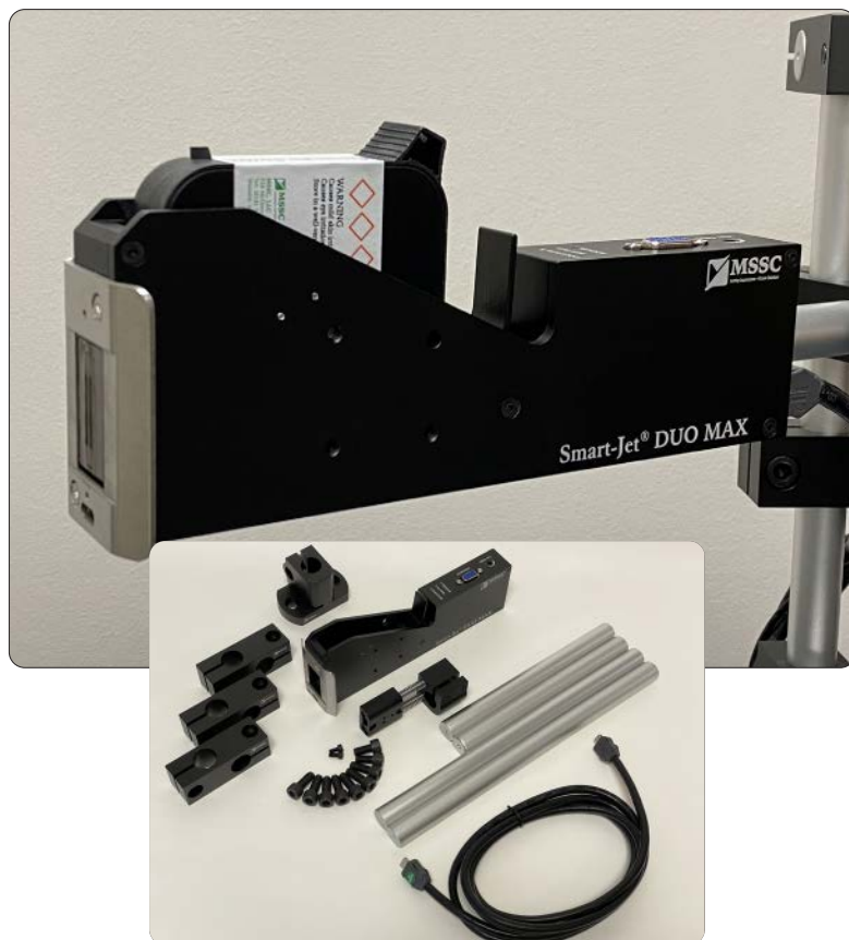
Pieces included in each printhead box