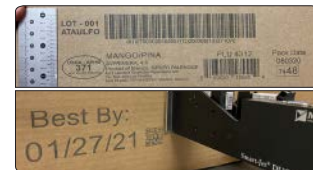
Porous and non-porous print