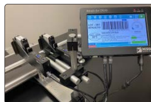
Connect up to 2 printheads at one time