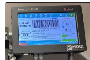
Message on 7" Touchscreen