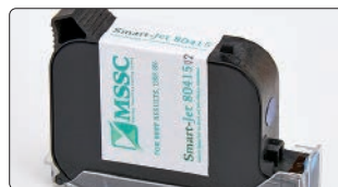
TIJ 1/2" cartridge technology