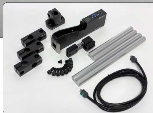
Pieces included in each printhead box