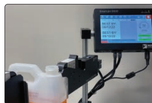
Connect up to 2 printheads at one time