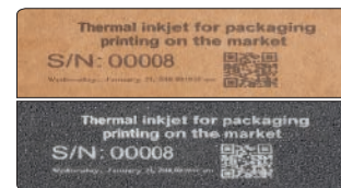
Porous and non-porous print