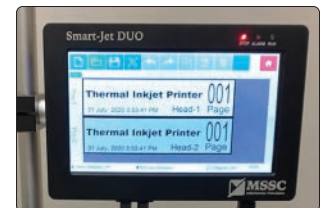
Message on 7" Touchscreen