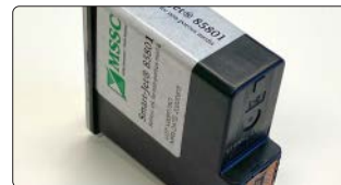
TIJ 1/2" cartridge technology