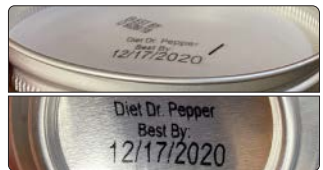
Printing on bottom and lid of can