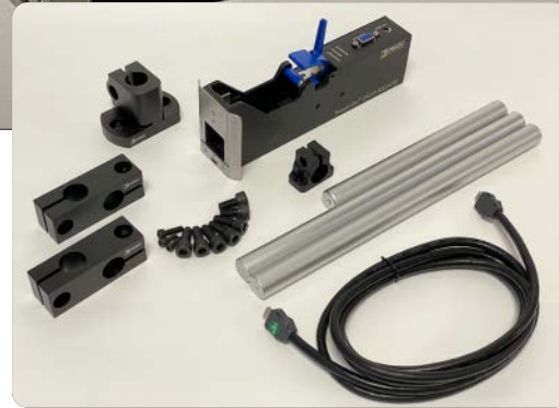
Pieces included in each printhead box